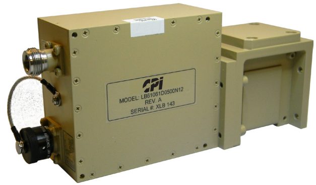
CPI X-band High Performance Low Noise Amplifier, Model LB61

Specifications included are for a standard product. Please contact CPI for your custom or specific performance needs.