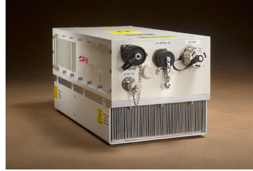
CPI GaNLink™ 80 W Ka-band GaN SSPA / BUC, Model SA49KOA / SB49KOA

Backed by over 40 years of satellite communications experience, and CPI's worldwide 24-hour customer support network that includes more than 20 regional factory service centers.